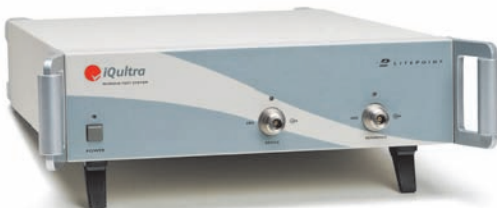
IQultra WiMedia Test System

All of these and other tests are pre-defined and accessible through either a graphical user interface or a C/C++ API. This allows users to rapidly characterize WiMedia devices either in an R&D environment, or develop automated test programs for manufacturing test.